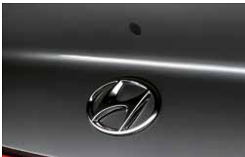
Rear camera and concealed boot lid button