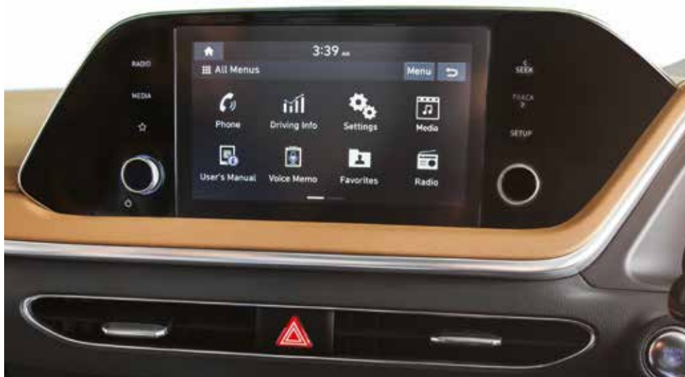
8" floating infotainment system display

The floating infotainment display offers you latest features and connectivity, while you nestle comfortably in the Leather upholstered luxury seats.