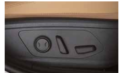
10-way powered Driver Seat + 4 way powered Passenger Seat