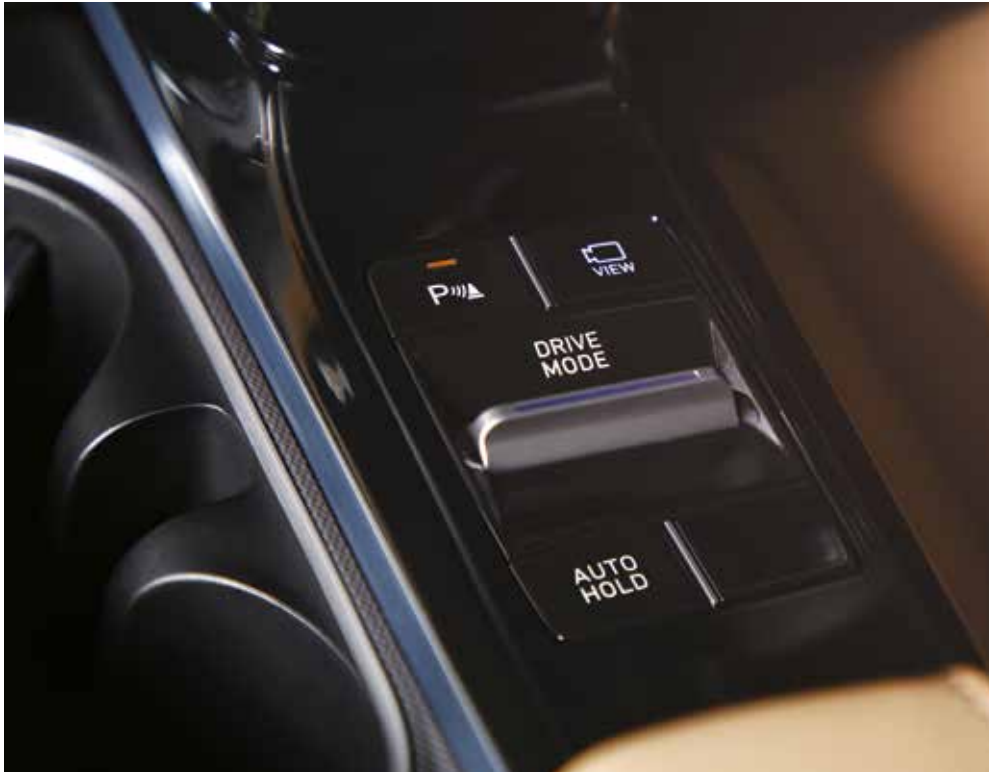
Auto brake hold

A road mishap may not be on your radar, but Hyundai Sonata is best-in-class when it comes to your safety. All geared up with Auto Brake Hold, Electronic Parking Brake, Electronic Stability Control, Hill-Start Assist, ISOFIX Child Seat Anchors and 6 Airbags. Sonata's top-notch safety technology loves and protects you like family.