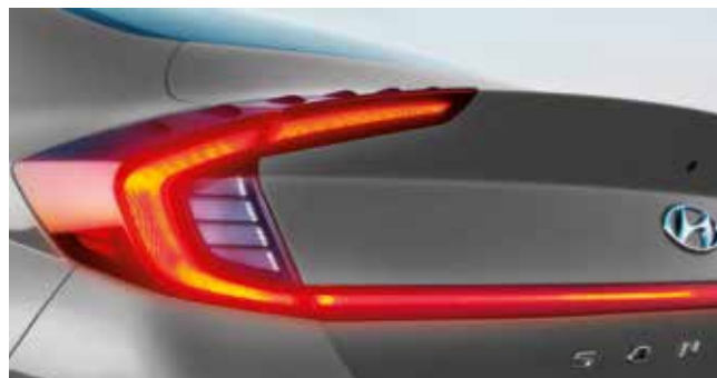
Horizontal LED rear combination tail lights