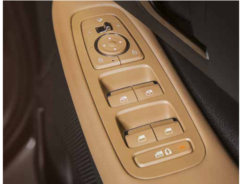
Auto child lock