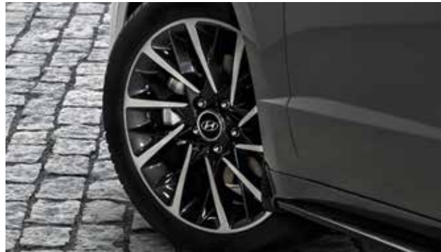
18 inch Alloy wheels