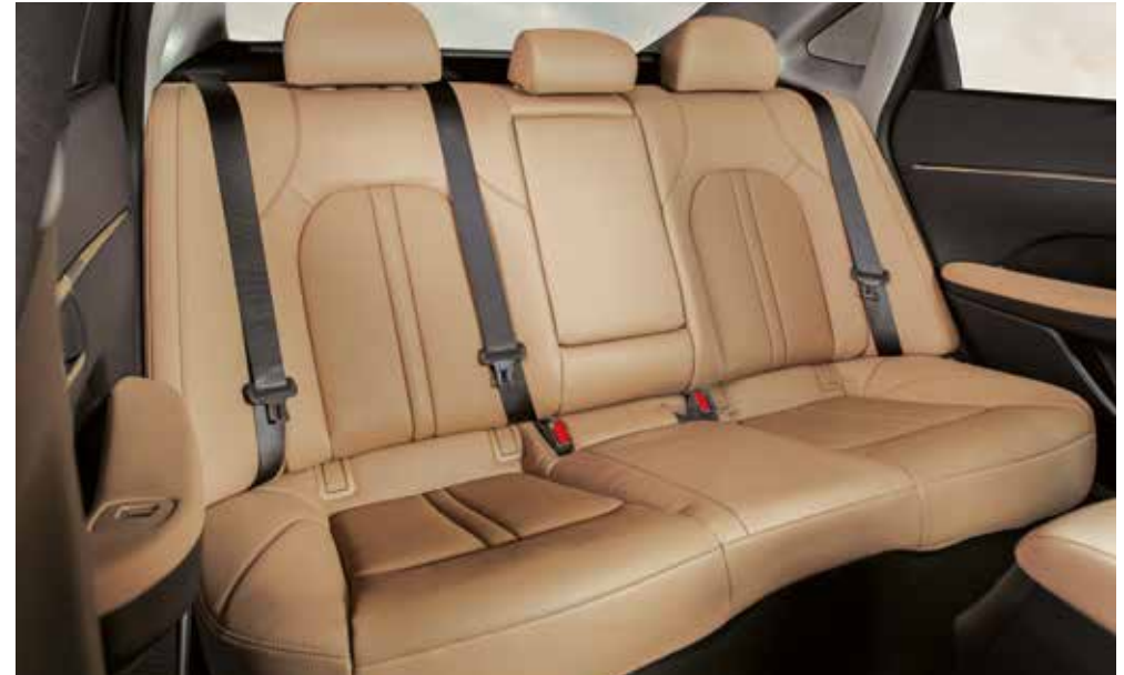
Rear seat with armrest