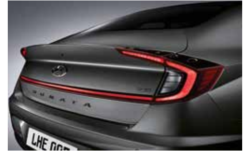
Horizontal LED Rear Tail lights with LED turn signal lamps