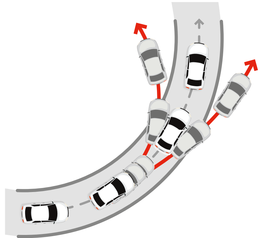
Electronic Stability Control (ESC) and Traction Control