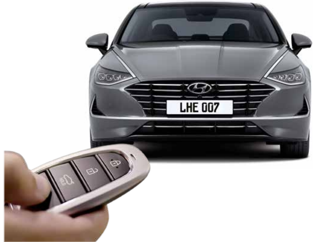
Remote engine start

The SuperVision cluster seamlessly integrates an expanded array of information presented in clear, concise and colorful graphics. By automatic adjustment of the transmission shift schedule, the integrated driving mode offers the driver a choice of five types of drive settings to suit drive preference, each displayed in its own specific color.