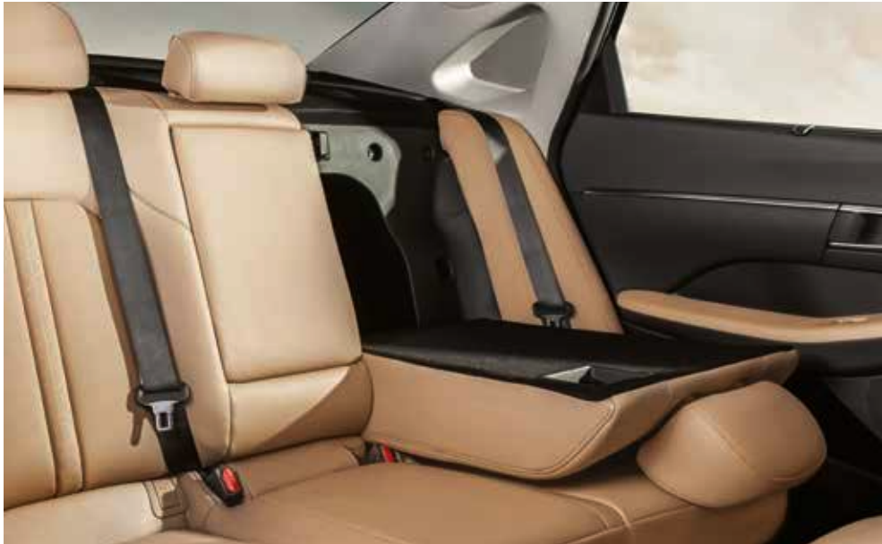
60:40 split folding seats

Sonata takes equally good care of its passengers with seats that bolster and support the spine's natural S-curve so you can really feel the difference that good design makes. The relaxation comfort seat allows the front passenger to unwind by replicating the spinal support of a reclining chaise lounge to achieve a feeling of near weightlessness.