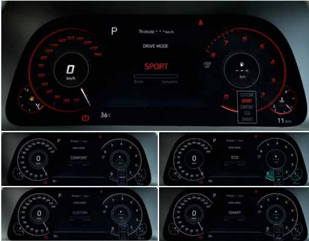
12.3 inch full LCD cluster/Integrated driving mode (Comfort/Smart/Eco/Sport/Custom)

Step inside and discover an interior that engages and satisfies all the senses. The cabin is a visual feast projecting elegance and warmth while delivering a rich tactile experience. The dials of the SuperVision cluster come to life with stunning clarity and show impressive depth. Numbers and batons are crisp and clean with the gauges scoring big points for their elegance and functional simplicity.